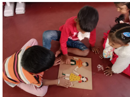
Preschool Education- New academic batch