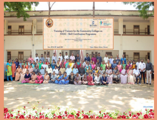
TOT (training of Trainer) was conducted by ICRDCE and NSDC in Chennai- 4 Trainers attended the training.