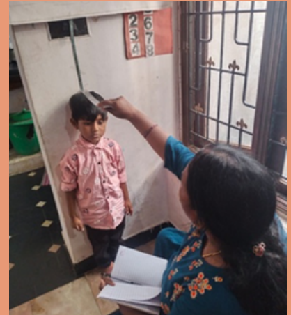
Height and weight Assessment