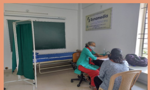
Health checkup for students