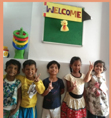
New batch children