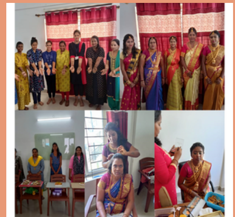
Talent's day celebration