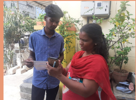
MOBILISATION FOR CUF PROGRAMS