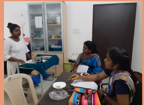
GENERAL DUTY ASSISTANT ASSESSMENT SESSION