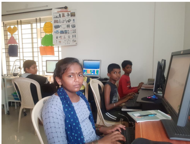
SUMMER COMPUTER CLASSES