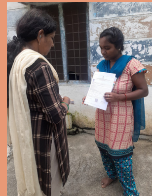
GOVERNMENT I.D. APPLICATION