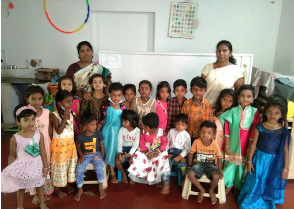
Child Care Center in Ulsoor