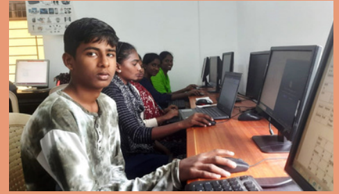
BASIC COMPUTER CLASSES

-Three days of orientation and ice breaking sessions were conducted for all the new students. The rules and regulations of the Community college were also presented to them.