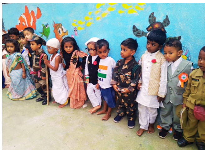
INDEPENDENCE DAY PROGRAM AT CC 2 RS PALYA