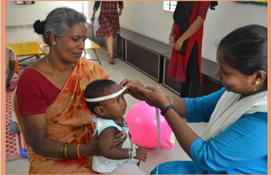
WELL BABY SHOW