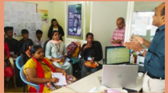
TRADE SKILLS EXPOSURE VISIT COMPUTER STUDENTS & TAILORING STUDENTS