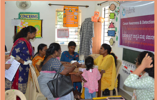
CANCER SCREENING CAMP