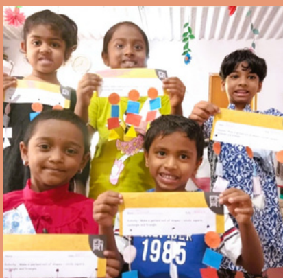
KEY FOUNDATION ACTIVITY AT ULSOOR CC CENTRE