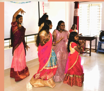
TALENTS DAY FEBRUARY 2024