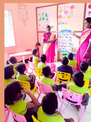
ECCE STUDENT INTERNSHIP