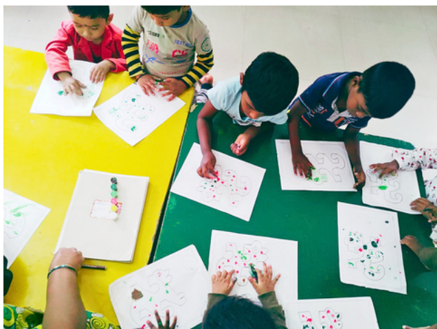
CHILD CARE CHILDREN ENGAGED IN CREATIVE WORK