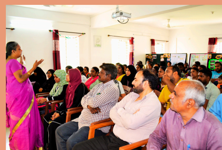
FAMILY MEET MARCH 2024