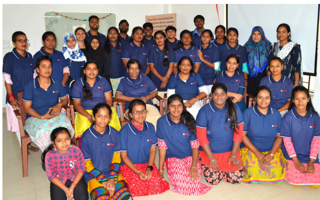
COMMUNITY COLLEGE STUDENTS IN THEIR BOSCH UNIFORM

HOWEVER DIFFICULT LIFE MAY SEEM, THERE IS ALWAYS SOMETHING YOU CAN DO AND SUCCEED AT.