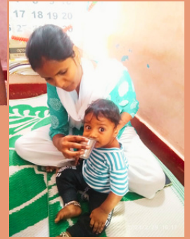
WELL BABY SHOW